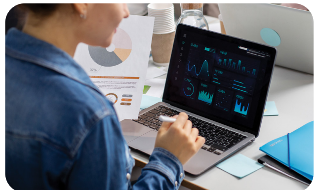
A small e-commerce business in Chicago was struggling with high email bounce rates. After adopting Melissa's Email Verification, they doubled open rates from 15% to 30% in just a couple of campaigns.